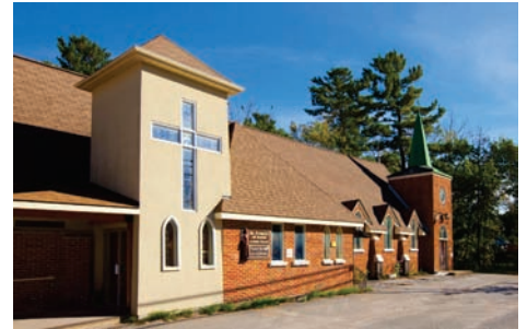
ST. FRANCIS - WASHAGO