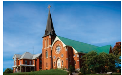
ST. COLUMBKILLE - UPTERGROVE