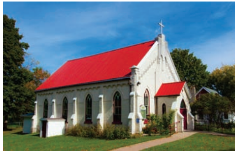
SACRED HEART - WARMINSTER