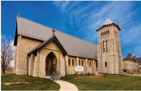
ST. ANDREW'S - BRECHIN