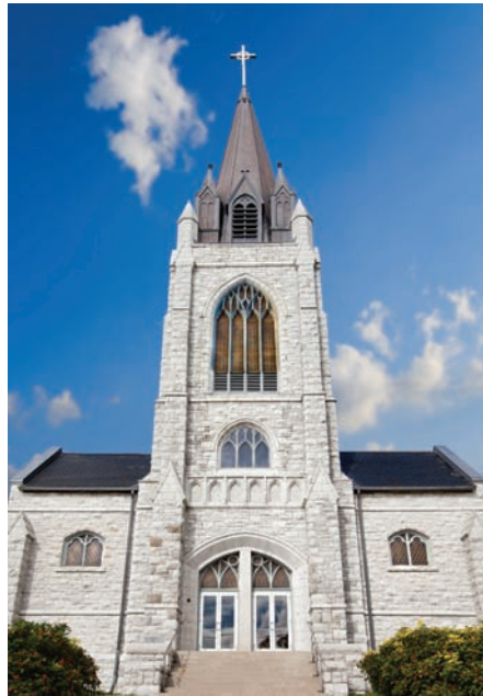
GUARDIAN ANGELS - ORILLIA