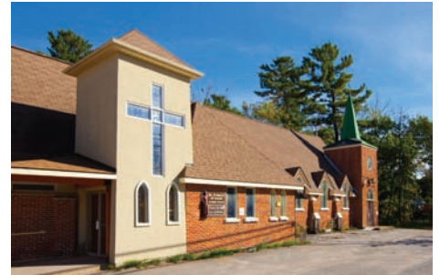
ST. FRANCIS - WASHAGO